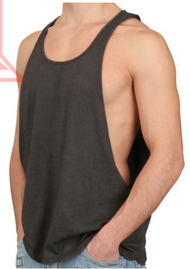
Deep Cut Singlet