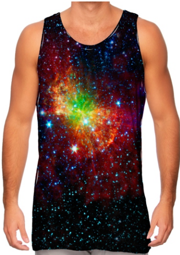
Tank Top For Men

Material: 100% cotton, cotton and polyester , 100% polyester ,Combed Cotto L, XL, M, S