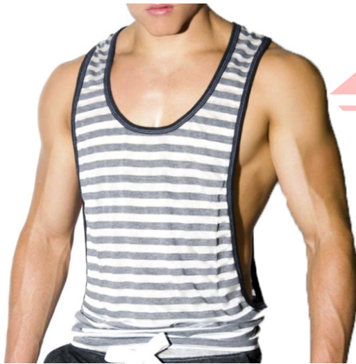
Deep Cut Singlet