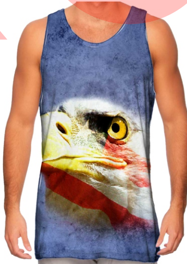
Tank Top For Men

Material: 100% cotton, cotton and polyester , 100% polyester ,Combed Cotto S, M, L, XL