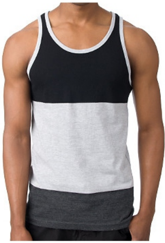
Tank Top For Men