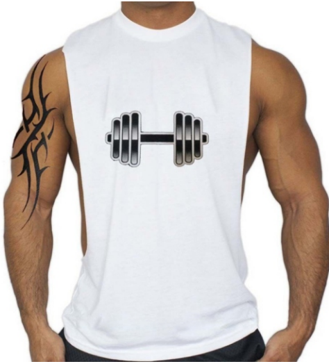
Deep Cut Singlet