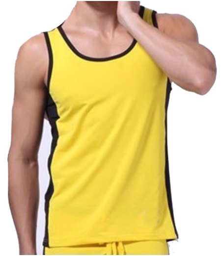
Tank Top For Men

Material: 100% cotton, cotton and polyester , 100% polyester ,Combed Cotto L, XL, M, S