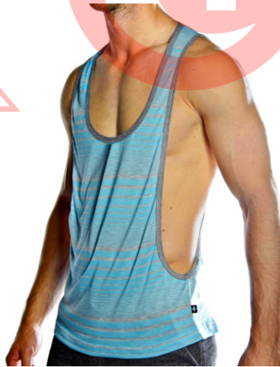
Deep Cut Singlet