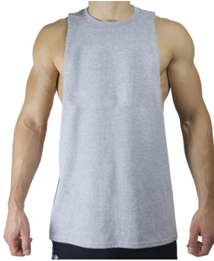
Deep Cut Singlet