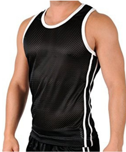
Tank Top For Men

Material: 100% cotton, cotton and polyester , 100% polyester ,Combed Cotto S, XL, L, M