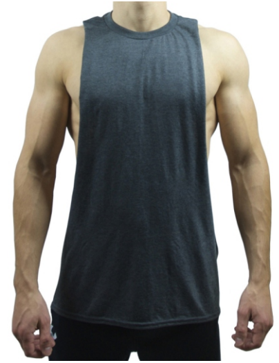
Deep Cut Singlet