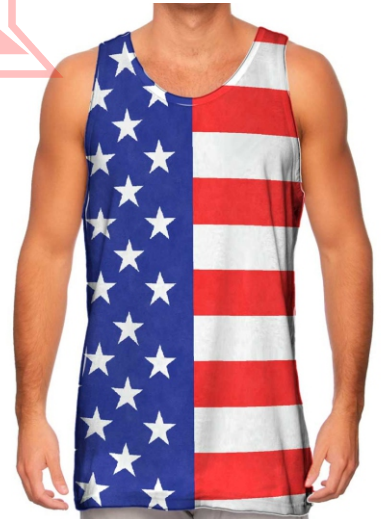
Tank Top For Men

Material: 100% cotton, cotton and polyester , 100% polyester ,Combed Cotto S, M, L, XL